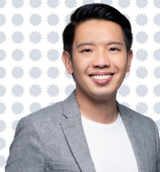
Guest Speaker: Mr Alvin Tan Minister of State Ministry of Culture, Community and Youth Ministry of Trade and Industry

She is currently also the President for Mendaki Club and NYC's INSPIRIT member.