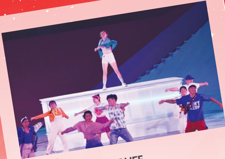
Chapter 1 THIS IS THE LIFE