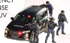
EMERGENCY RESPONSE TEAM SUV