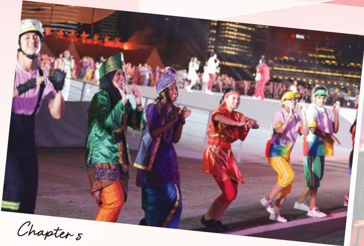
Chapter 5 STRONGER TOGETHER, MAJULAH!