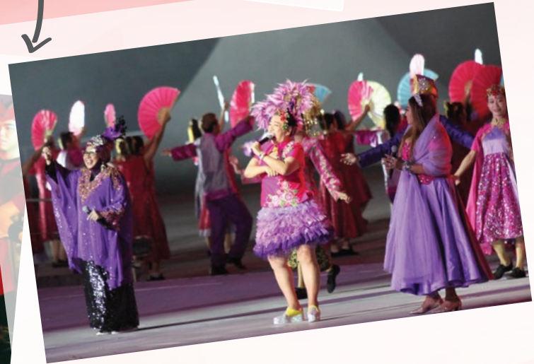
Chapter 3 TOGETHER