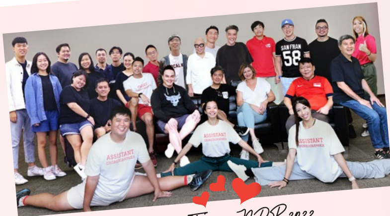
Creative Team. NDP 2022

Creative Director, National Day Parade 2022