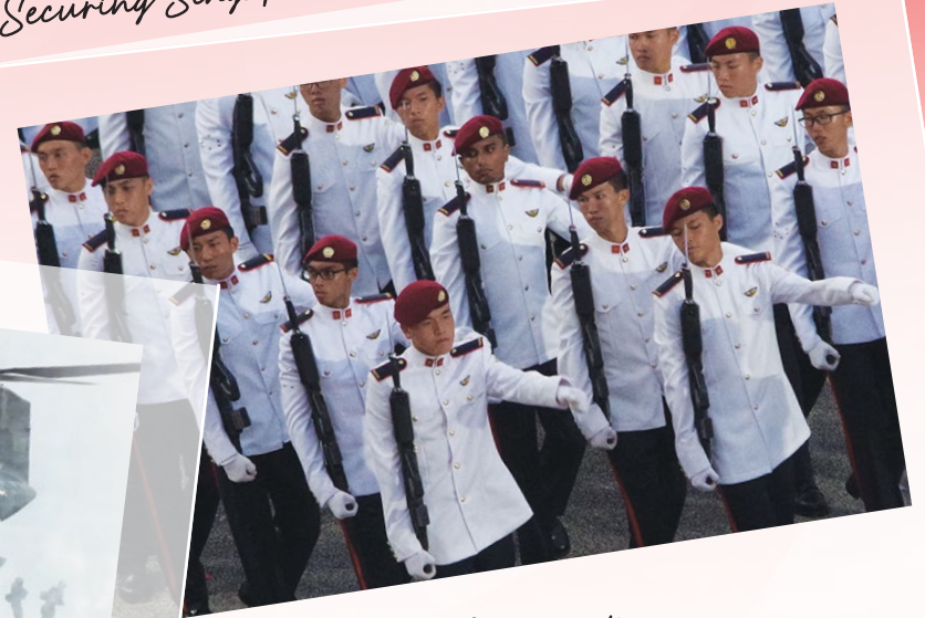
Parade & Ceremony