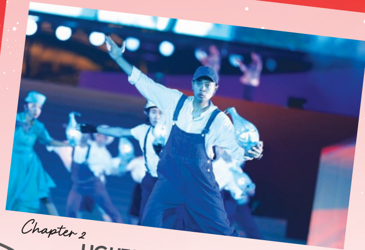
Chapter 2 LIGHTS IN THE DARK