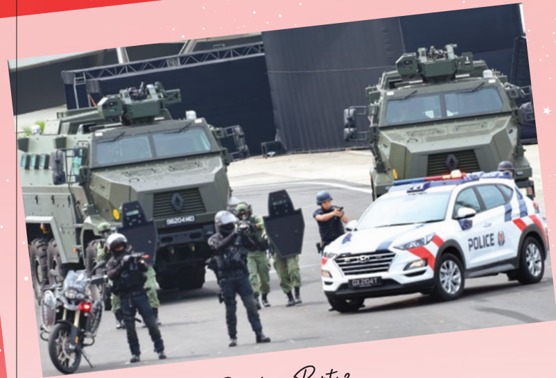
Total Defence Display Part 2 Securing Singapore Together