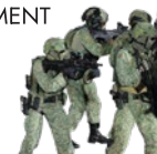
ARMY DEPLOYMENT FORCE