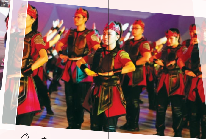
Chapter 4 FIGHT!