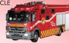
HAZMAT MITIGATION VEHICLE