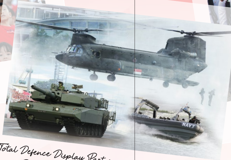
Total Defence Display Part 1 Defending Our Country