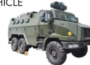
PROTECTED RESPONSE VEHICLE